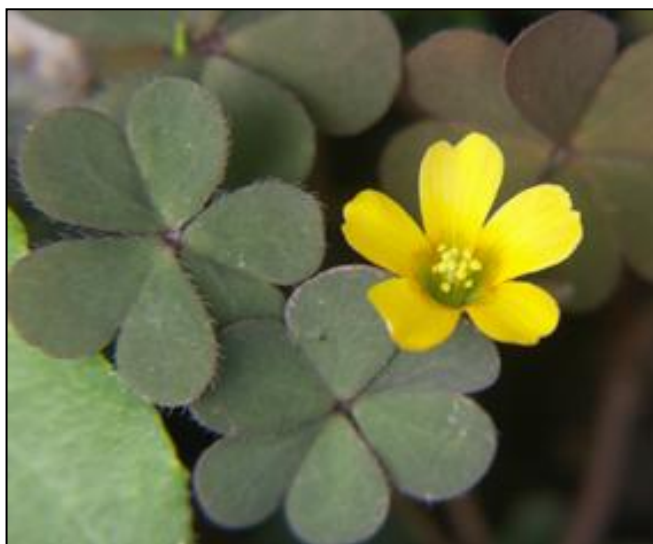
Oxalis corniculata var. atropurpurea (Procumbent Yellow-sorrel) [Bletchley]