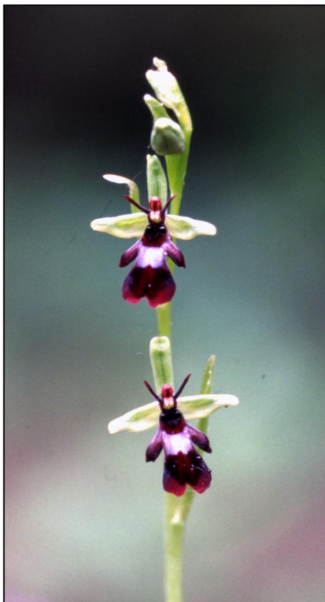
Ophrys insectifera (Fly Orchid) [Homefield Wood]