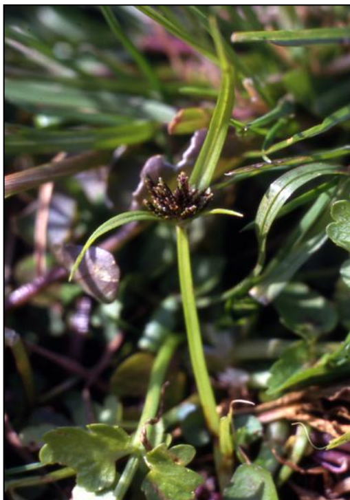
Cyperus fuscus (Brown Galingale) [Dorney Common]