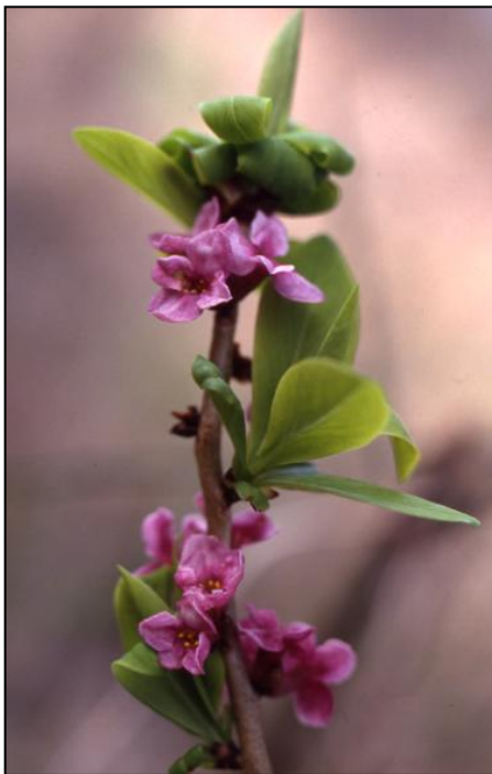
Daphne mezereum (Mezereon) [Aston Clinton]