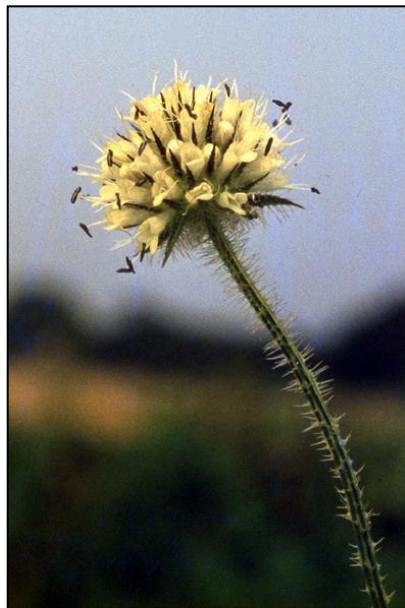
Dipsacus pilosus (Small Teasel) [Bozenham Mill]