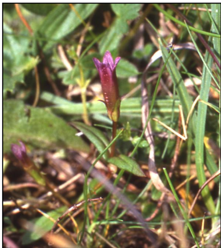
Gentianella anglica (Early Gentian) [Ivinghoe Beacon]