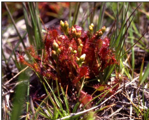
Drosera intermedia (Oblong-leaved Sundew) [Stoke Common]