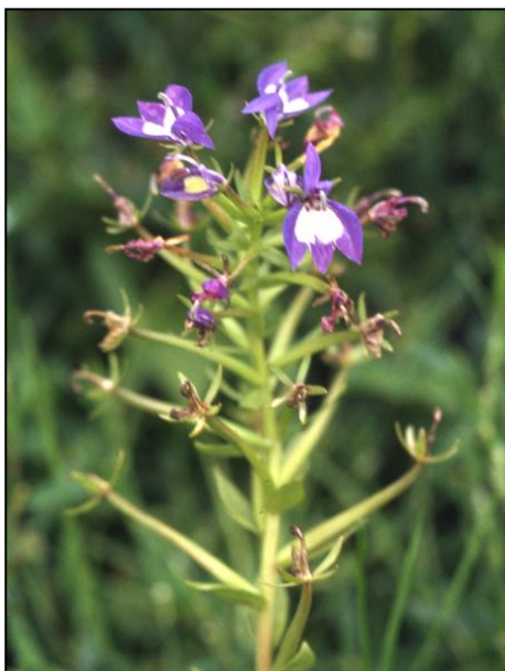
Downingia elegans (Californian Lobelia)