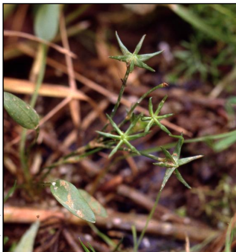
Damasonium alisma (Starfruit) [Naphill Common]