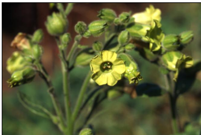
Nicotiana rustica (Wild Tobacco) [Great Missenden]