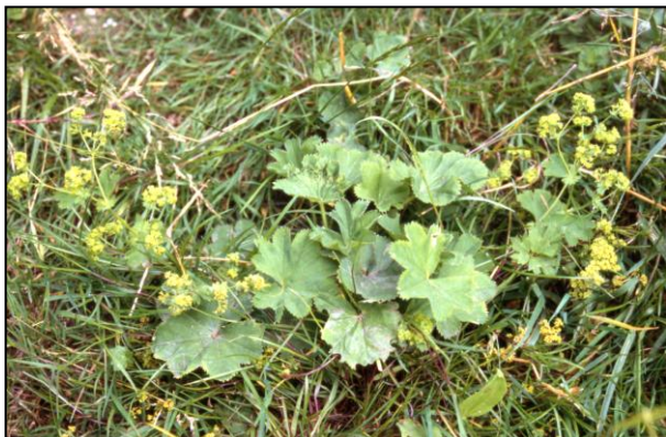
Alchemilla xanthochlora (Intermediate Lady's-mantle) [Halton Wood]