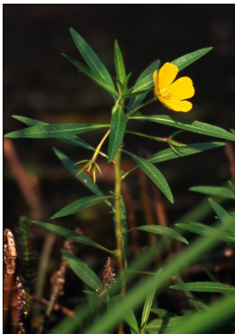
Ludwigia grandiflora (Uruguayan Hampshire-purslane) [Chesham Bois Common]