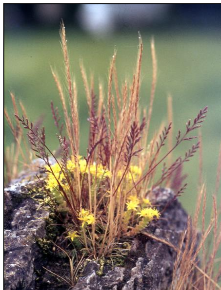
Vulpia ciliata ssp. ambigua (Bearded Fescue), Sedum acre (Biting Stonecrop) & Catapodium rigidum (Fern-grass) [Olney]