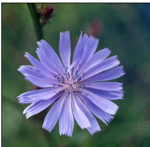
Cichorium intybus (Chicory) [Marlow Bottom]