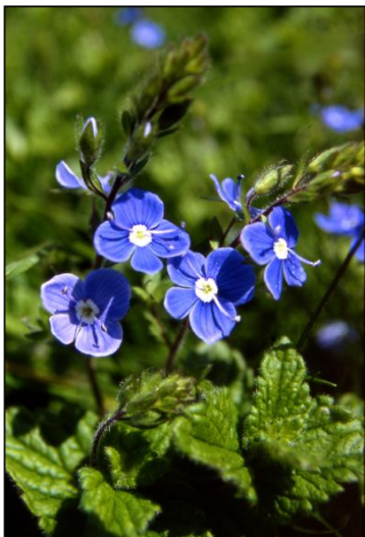
Veronica chamaedrys (Germander Speedwell) [Granglands]