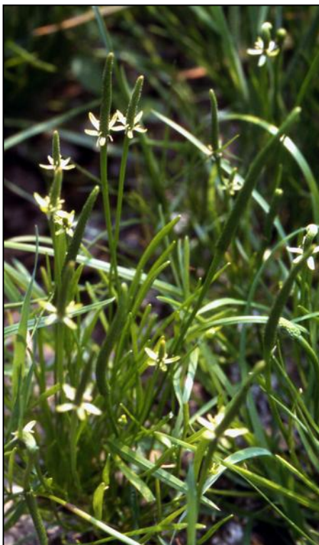
Myosurus minimus (Mousetail) [Long Herdon Meadow]