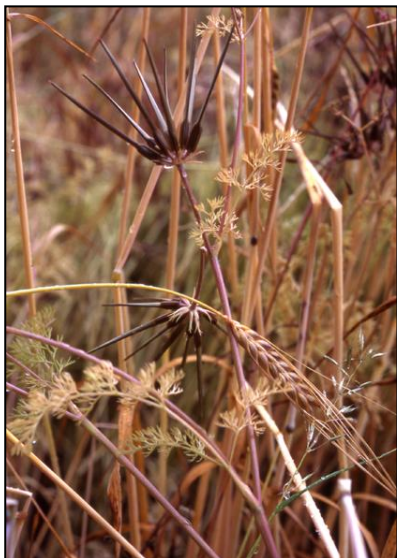
Scandix pecten-veneris (Shepherd's-needle) [Whelpley Hill]