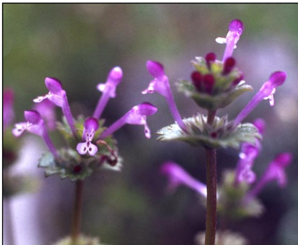
Lamium amplexicaule (Henbit Dead-nettle) [Bletchley]