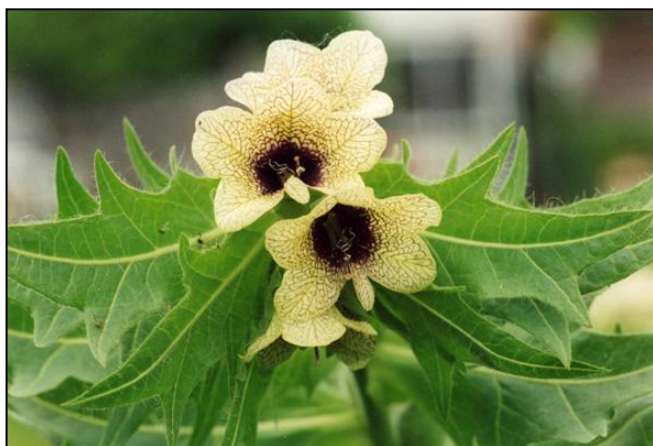
Hyoscyamus niger (Henbane) [Dorney Common]