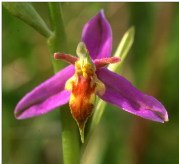
Ophrys apifera var. trollii (Wasp Orchid) [Broughton]