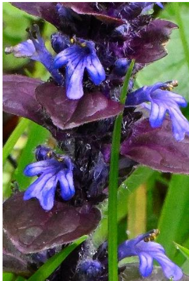
13. Bugle – close-up