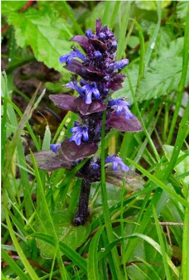
12. Bugle – whole plant