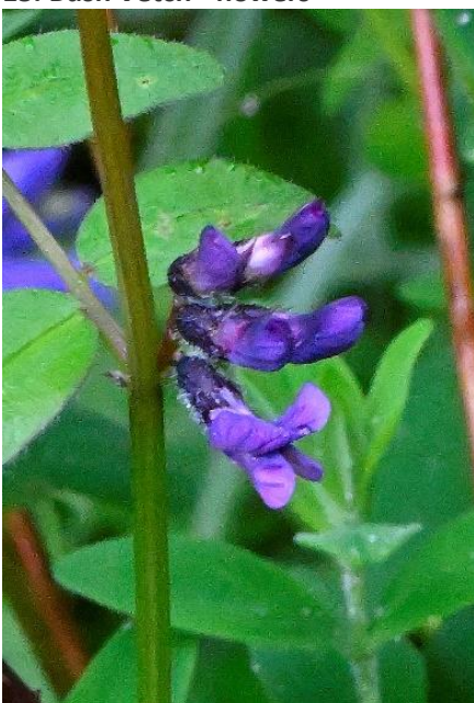
15. Bush Vetch - flowers