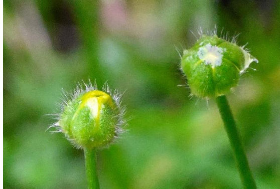
20. Meadow Buttercup - flower buds