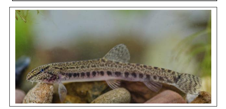
The elusive spined loach