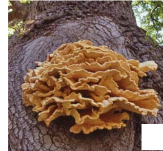
Chicken-of-the-Woods Laetiporus sulphureus

Where to find it: Parks & grassy places.