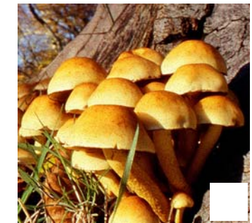
Sulphur Tuft Hypholoma fasciculare

This brimstone-hued toadstool grows in such crowded clumps that their caps often squash into each other.