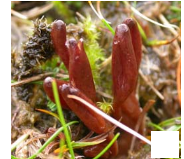
Earth tongues Geoglossaceae species

Say "aahh..." These fungi are aptly named, appearing like the tongue of some hidden beast lying beneath the earth.