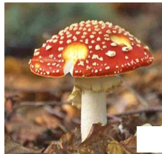
Fly Agaric Amanita muscaria

Where to find it: Various types of woodland.